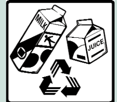
Milk and juice cartons Waxed paperboard only