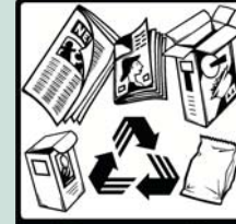
Paper & cardboard